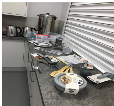
Photo of the most recent purchases.